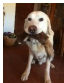
Latigo, the Reading Dog